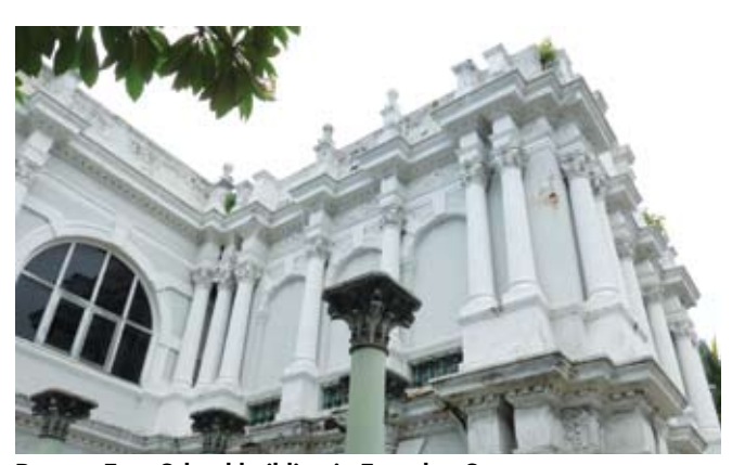
Penang Free School building in Farquhar Street.