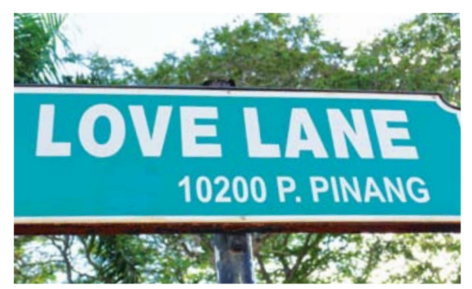
Love Lane, the location of the first Penang Free School.

The proposal was to have two schools – one for boys and another for girls – and that there would be boarders as well as day pupils. Fees would be paid by parents who could afford them while the children of