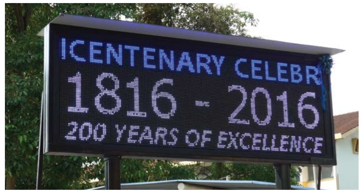
Digital countdown calendar to 200th anniversary

The vacant buildings left behind by the school at its Farquhar Street premises were retained and renamed Hutchings School to cater to primary school children in honour of its founder. It was to become one of the most important feeder institutions to Penang Free School.