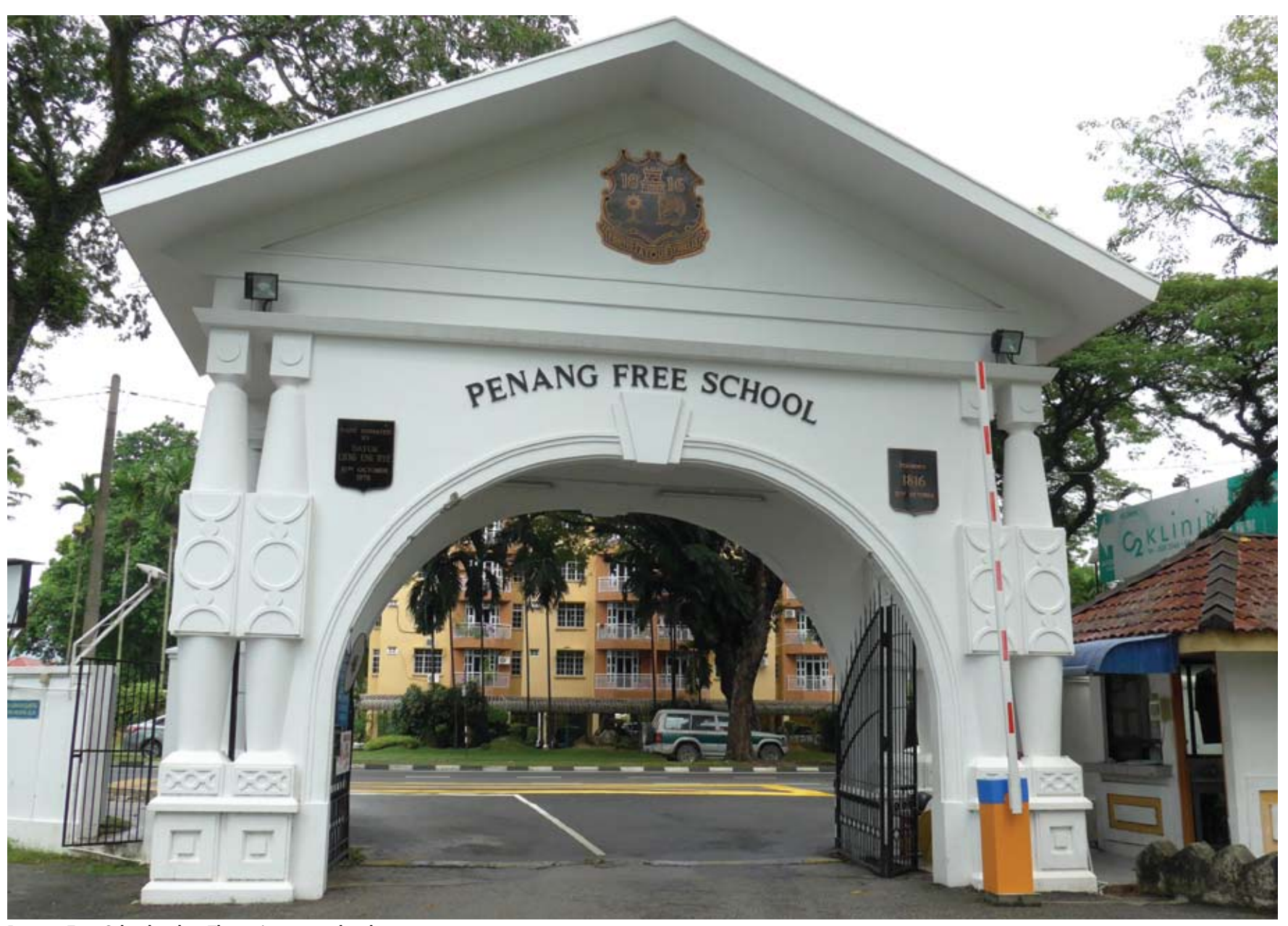
Penang Free School today: The main gate and arch.